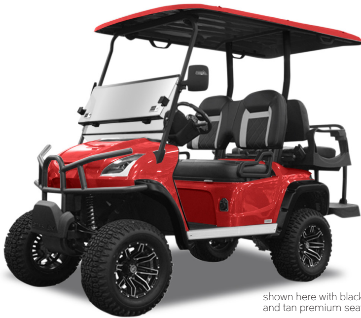
shown here with black and tan premium seats